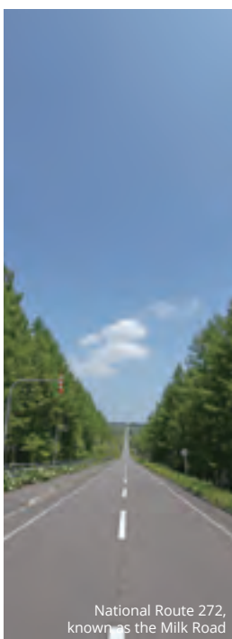
National Route 272, known as the Milk Road

On a map National Route 272, known as the Milk Road, appears to be straight, but it actually undulates vertically. This rolling shape holds an appeal for both passengers and drivers not found in a simple straight road. Limitless straight roads run crosswise and lengthwise across the enormous pasture like squares on a go board. The smell of the wind and vivid colors running along the road are certain to remain fresh in your memory.